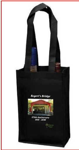
$5/2-Bottle Beverage Tote

Allentown Dept of Parks and Recreation 3000 Parkway Blvd. Allentown, PA 18104 Ph: 610-437-7750