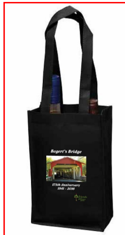
2-Bottle Beverage Tote

Available for collection at: Friends of the Allentown Parks 2700 Parkway Blvd. Allentown, PA 18104 Ph: 610-432-7275