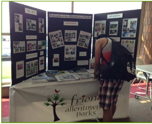
Lehigh Carbon Community College Volunteer Fair—9/11/13

Cedar Crest College and Lehigh Carbon Community College (LCCC) recently held volunteer fairs on campus affording Friends the opportunity to showcase our organization and promote our volunteer needs.