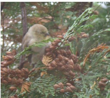
Left: American Goldfinch in winter plumage Below: Native plant bouquet