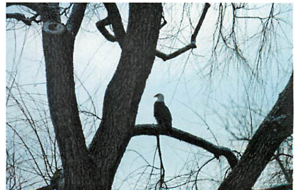
Bald Eagle in Cedar Creek Parkway

Friends of the Allentown Parks 3000 Parkway Boulevard Allentown, PA 18104 Phone: 610-437-7750 www.allentownparks.org info@allentownparks.org